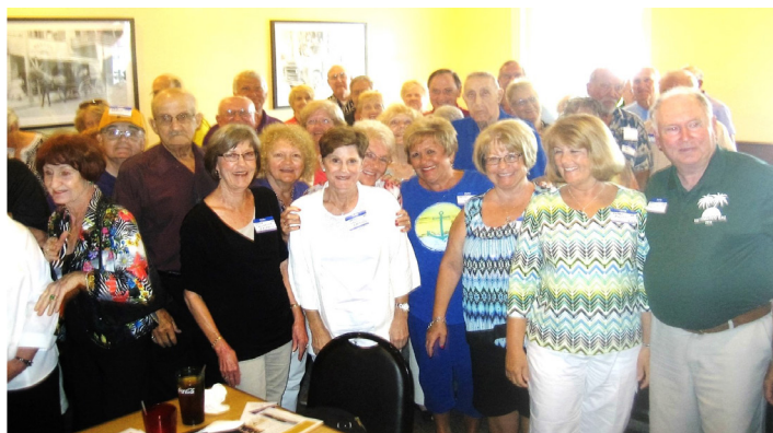
MHS alumni and friends gather at the Marion-Florida reunion on March 3, 2016, in Bradenton, Fla. The annual event is open to all MHS classes. See more photos on Page 4!