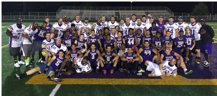
Friday Night Lights: alumni vs. current Giant athletes

"I cannot put to words how much fun I had ... at the Alumni Challenge football game. I thought October of '96 would be the last time I would be under those Friday night lights."