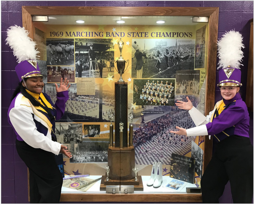
Current Marching Giants members show off the new display case for the 1969 Marching Giants' state championship trophy and memorabilia. They are wearing the new marching uniforms that the Marion High School Alumni Association helped purchase by donating a portion of the funds.